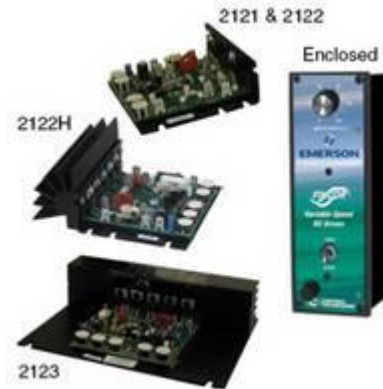
Fincor 2120 Series