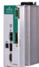
Compact Servo Drives