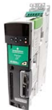
Intelligent Servo Drives