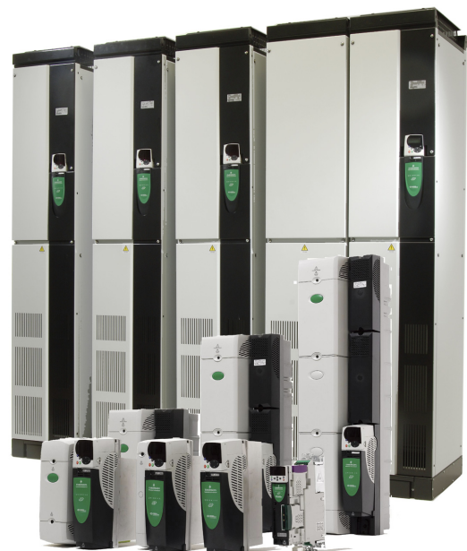
AC Drives to 2,900 hp

Contact Control Techniques for assistance identifying energy savings opportunities in your facility.